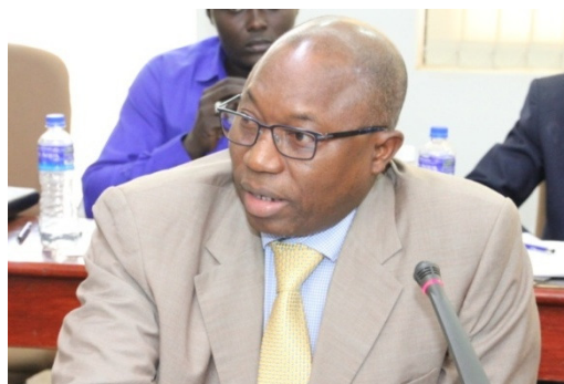
Hon. Mambury Njie, Minister of Finance and Economic Affairs, Delivered DFTR2 Keynote Remarks

DATE: Wednesday, 6 March 2019 TIME: 09.00 to 16.00